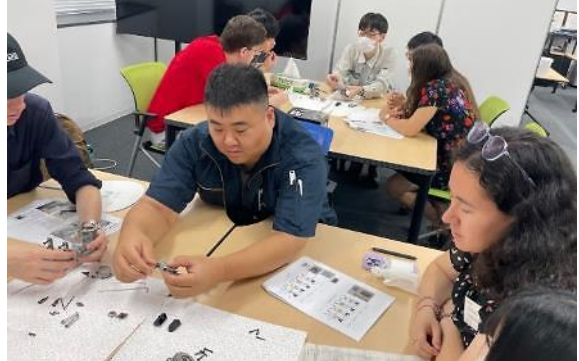
Assembly & Disassembly