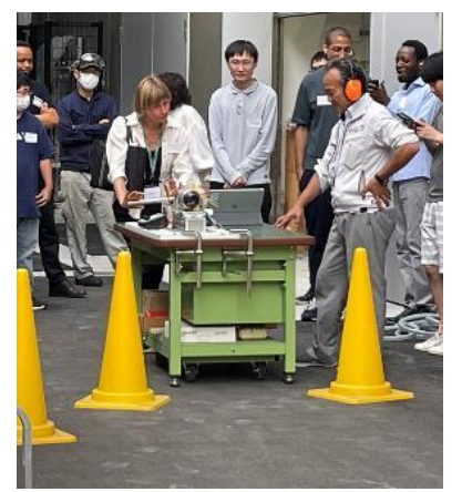
Jet engine Demonstration