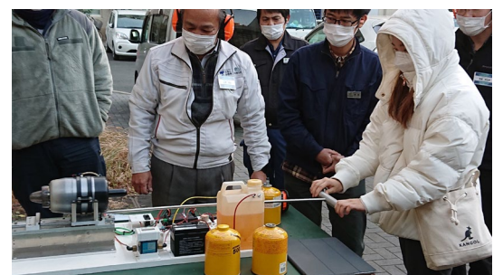
Jet engine Demonstration